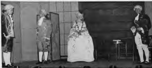
1923— School for Scandal —March, 1937*